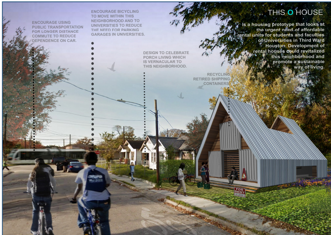
Figure 2: This O House can easily be converted into a duplex for rental income.