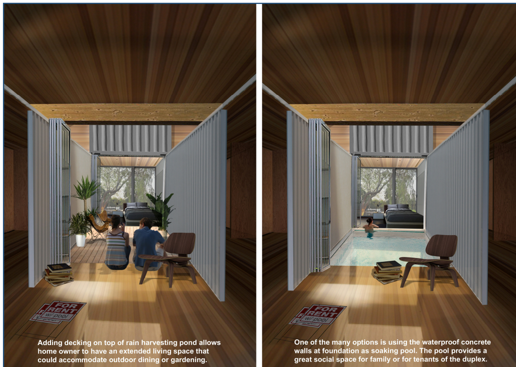
Figure 3: The versatile courtyard has myriad function such as pool, garden or play area.